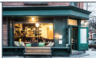
Photo size is 1" height x 1.65" width (Must be interior (full or partial) or exterior of business)

riverdelirestaurant.com • Charming corner location in Bklyn Heights near the Promenade & Bklyn Bridge Park. We combine classics from Italian cuisine w/ the favorite recipes & flavors of Sardinia. All Italian wine list spotlights a few indigenous varieties such as Carignano, Vermentino e Cannonau. Takeout available. Open for Dinner Su-Th: 5-10, F-Sa: 5-10:30, Brunch 11:30-3:50.